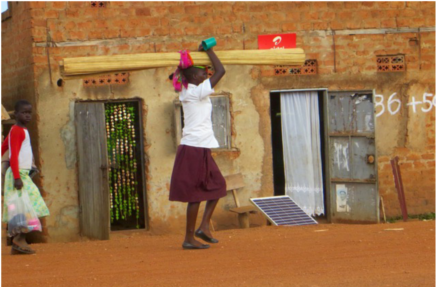
Credit: Young woman carrying a mat in Gulu town, Uganda. Thomas Cole.

an Acholi-dominated neighborhood of Kampala known as Acholi Quarter. We also selected two rural areas where we conducted interviews with individuals with family members who had out-migrated. These interviews helped provide a rural perspective on migration. This report is exclusively concerned with domestic internal migration – i.e. movement between rural and urban areas within Uganda. 2