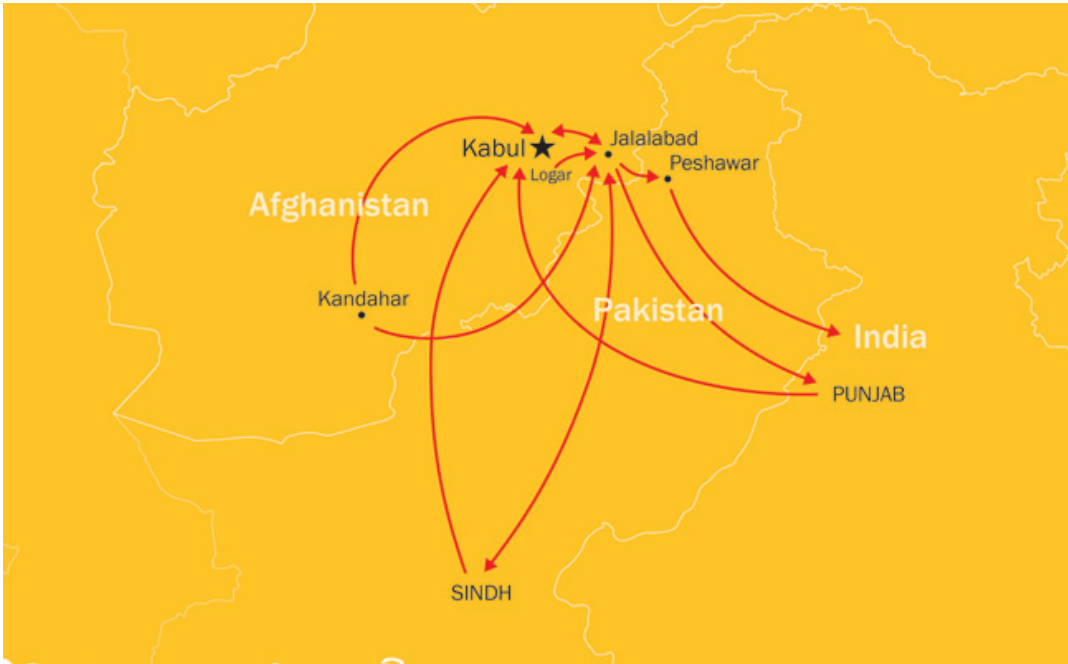
Figure 3: Onion trade flow between Pakistan, India, and Nangarhar and other provincial capitals in Afghanistan